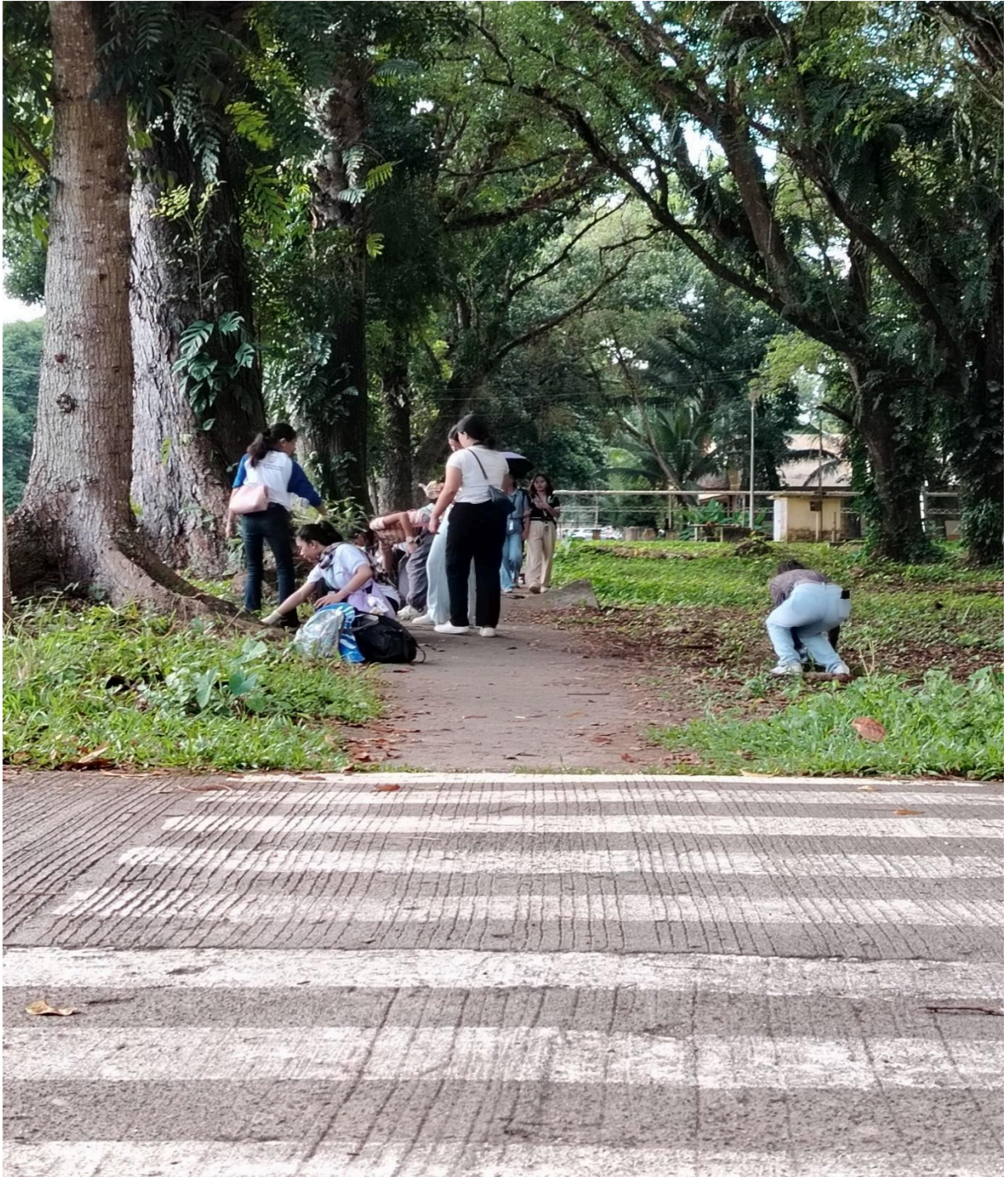
STUDENTS HELPS MAINTAIN CLEALNESS OF THEIR AREA OF RESPONSIBILITY THROUGH NSTP-CWTS PROGRAM