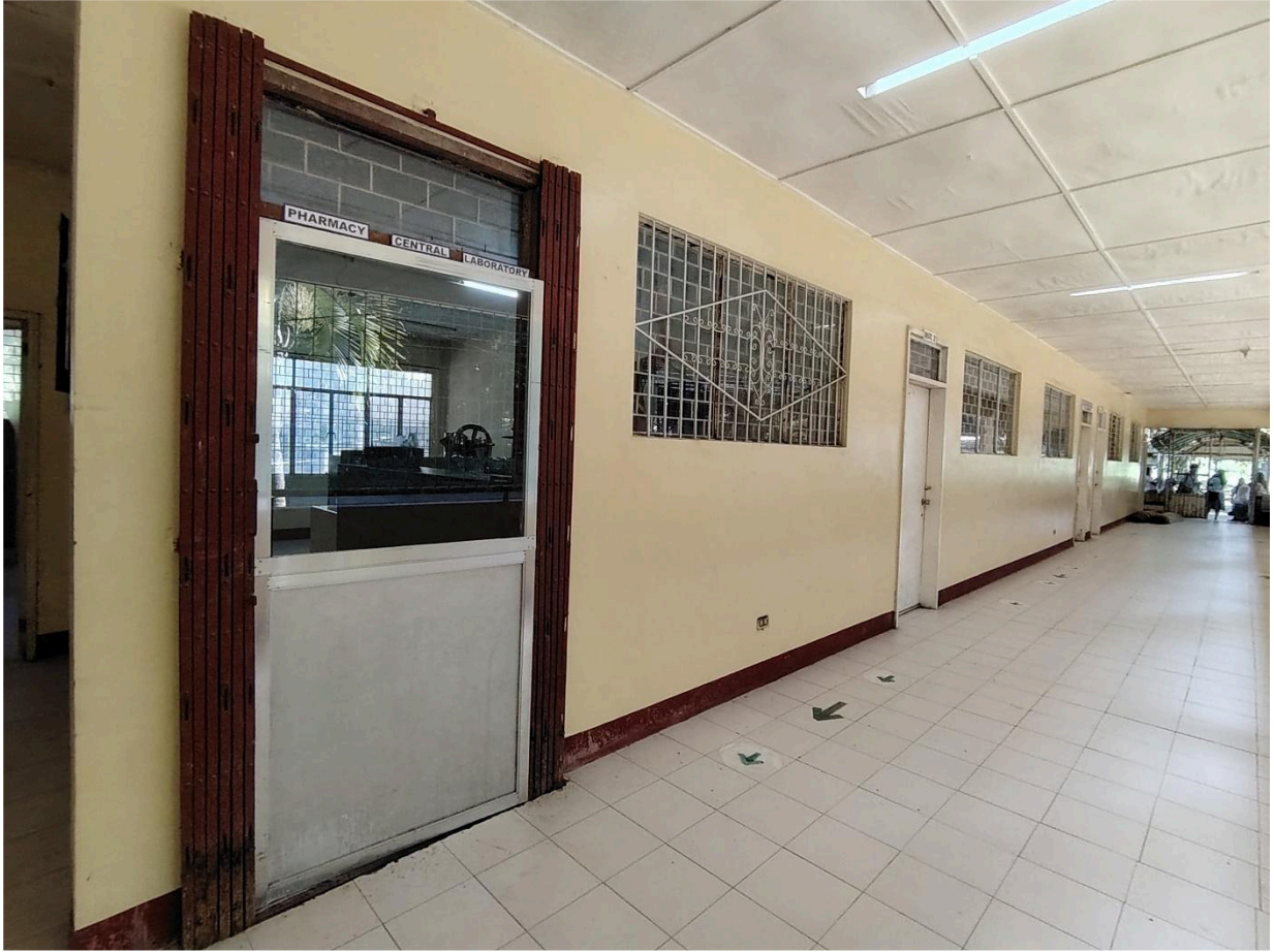
NO WASTE BINS INSTALLED IN COMMON AREAS TO LIMIT WASTE PRODUCTION