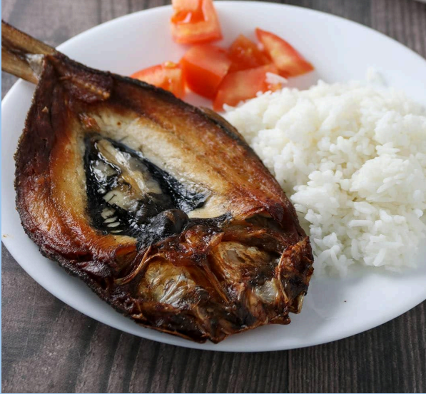
Daing na Bangus - Kawaling Pinoy

We're celebrating one of our favorite months this May: AANHPI (Asian American Native Hawaiian Pacific Islander) Heritage Month! We're honoring the heritage of everyone here of Asian and Pacific Islander descent by sharing some of the customs and traditions of people of Asian nations and islands in the Pacific.