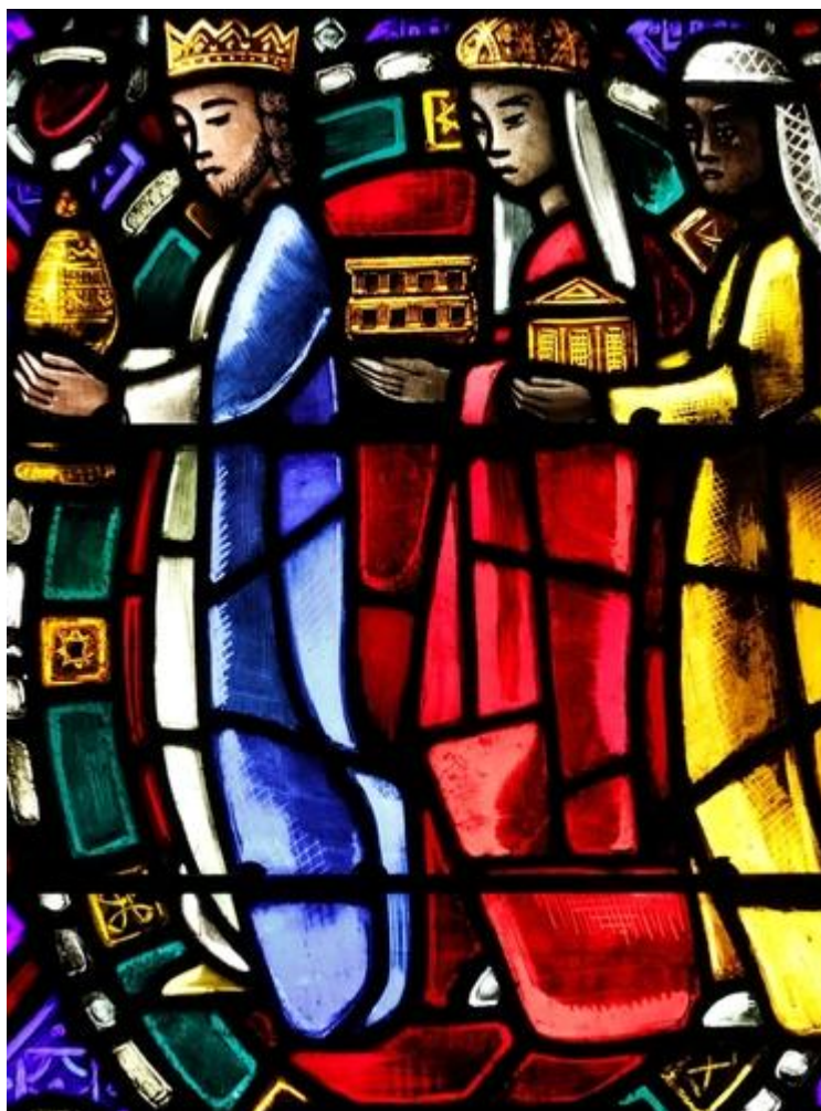
Stock Photo ID: 2192215135. The American church in Paris. Stained glass window. Nativity. Adoration of the Child Jesus by the three wise men or Magi. France. 02-27-2020. Important information. Editorial Use Only.

Epiphany is a Greek word meaning "manifestation," or "showing" or "revelation." In ancient times, the term referred to an official visit by a King or Queen. This is a public presentation or showing to the people of a sovereign.