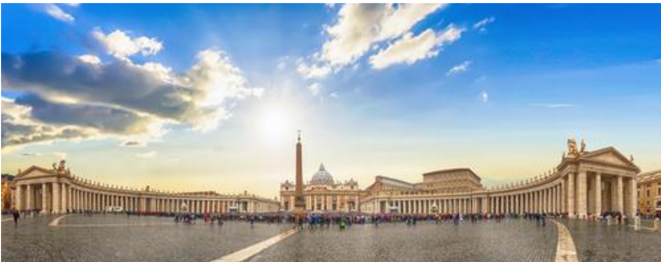
Stock Photo ID: 402764872 - Panorama view of Saint Peter's Basilica and square on sunrise in Vatican, Italy - Photo Formats

5. A Church "out of every tribe, tongue, people and nation."