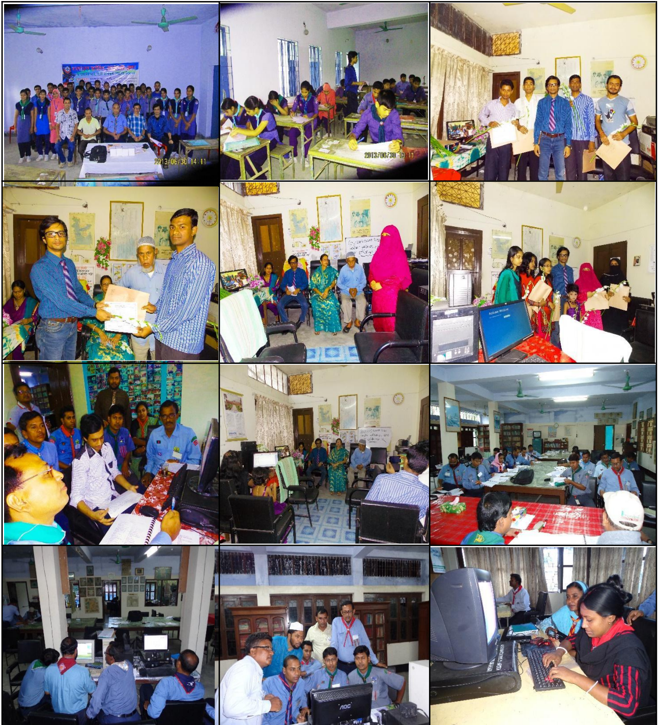
WORK PORTFOLIO IMAGE GALLERY-02