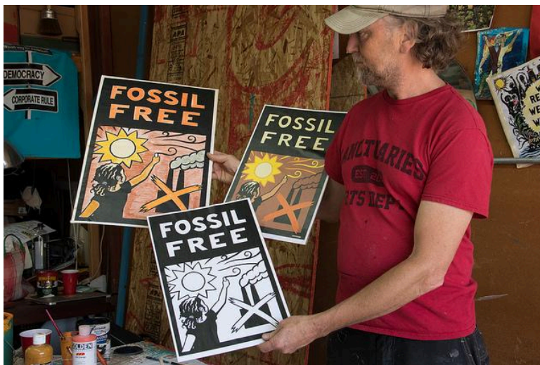
Hand-colored (upper left) color printer (upper right) and black and white.