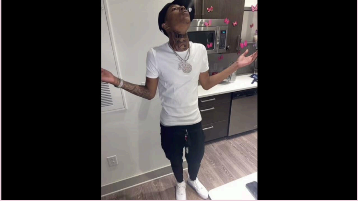
[FREE] Big Scarr x Pooh Shiesty x Big 30 Type Beat - "Murda Flow" (1.4 Million Views):