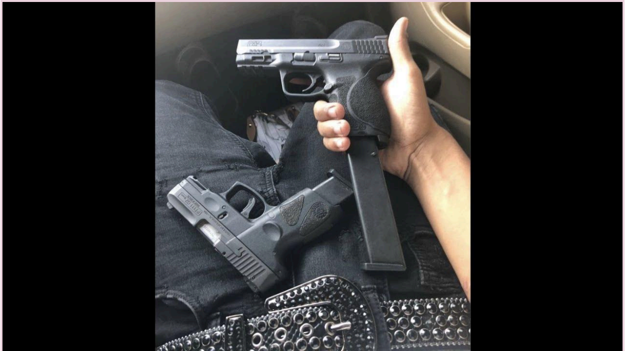
[FREE] Big Scarr Type Beat - "Lay Em Down" (1 Million Views):