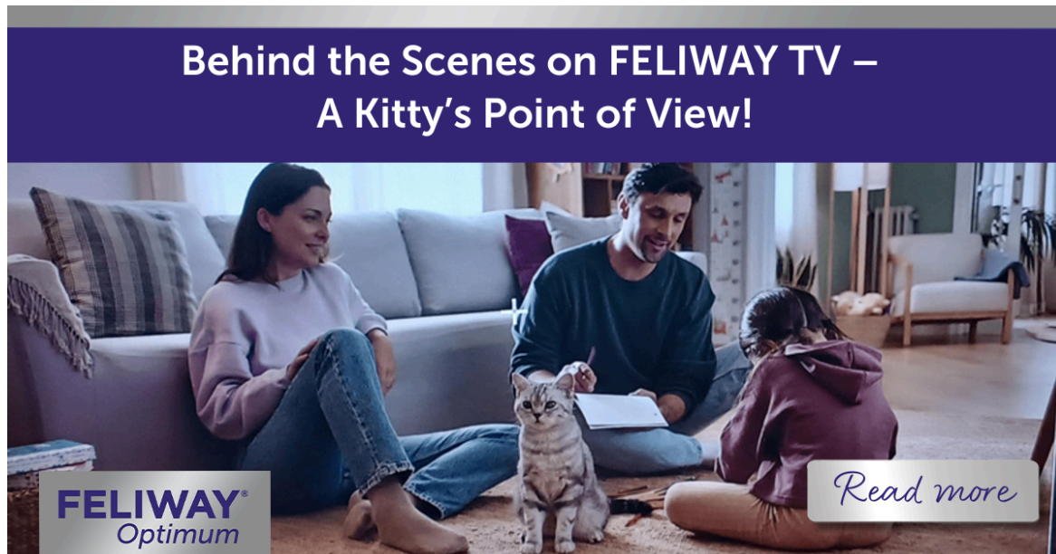
Image Alt-text: Filming screen of a happy family sitting around a cat.

Ever wondered what life's like in front of the cameras? Then allow me to introduce myself. I'm Coco, the feline superstar you may have seen gracing your screens in the recent FELIWAY Optimum adverts. I know, I know – try not to become too starstruck. My agent will send you a signed photo. Now, it's time to follow in my paw prints as I whisk you away on a tail-twitching tour of what went down behind the scenes.