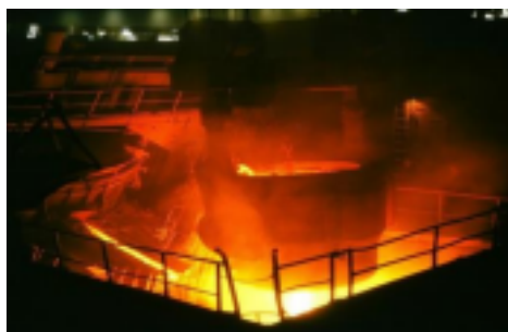
Figure 2. Steelmaking – refractory materials are used in the crucible

Demo Description: In this demo, a propane torch will be used to heat one side of a refractory brick. A thermometer will be used to monitor the other side of the brick, which should remain cool during heating.