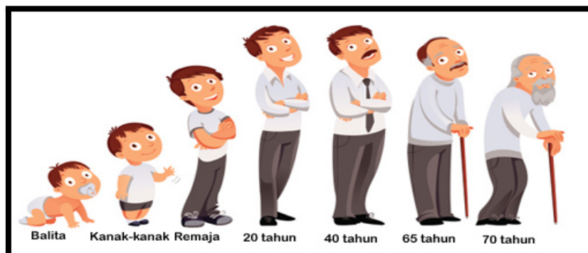
Figure 3. A figure in two-column format.

“Continuous.” Apply this step before inserting the figure, and repeat the same step after the figure has been inserted.