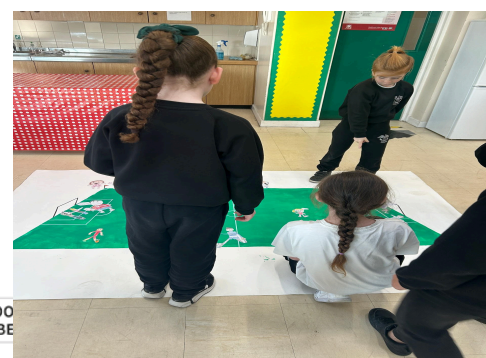
Respect Teamwork & Exploration