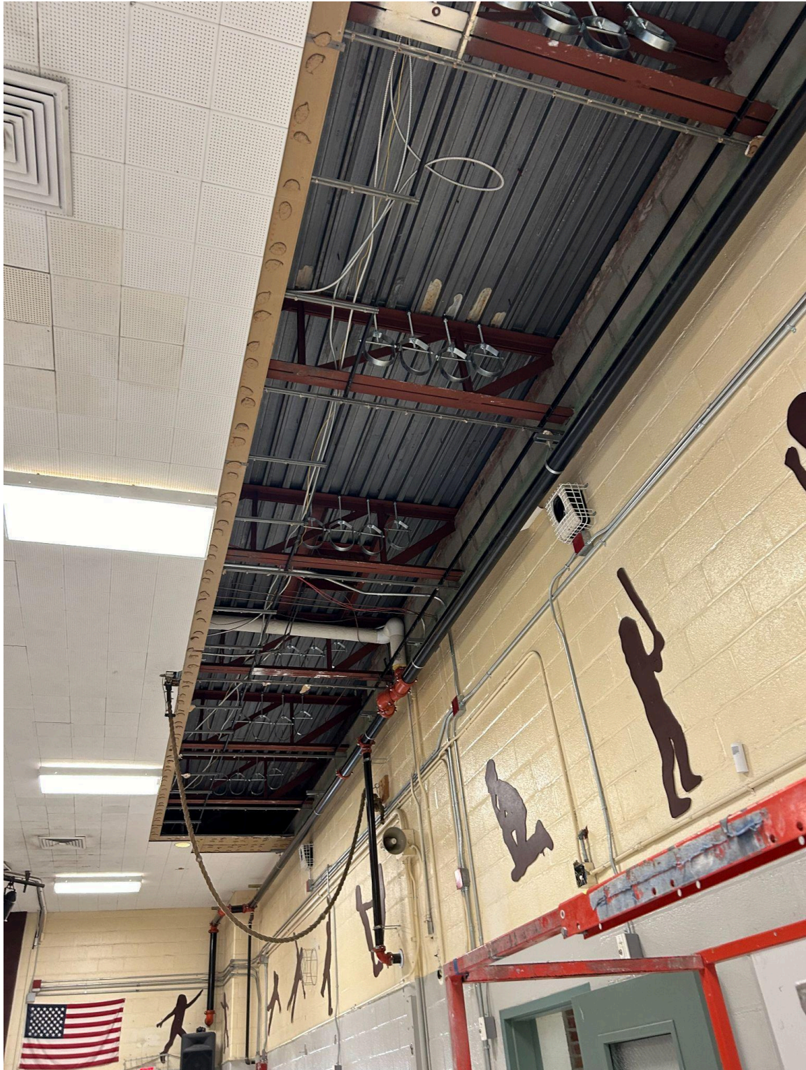
Picture of piping hangers being installed in the ceiling of the GYM so that new piping can be placed in the hangers. The new piping will serve new mechanical equipment that is being placed on the roof, that will run off from the Geothermal wells being installed in the playground.