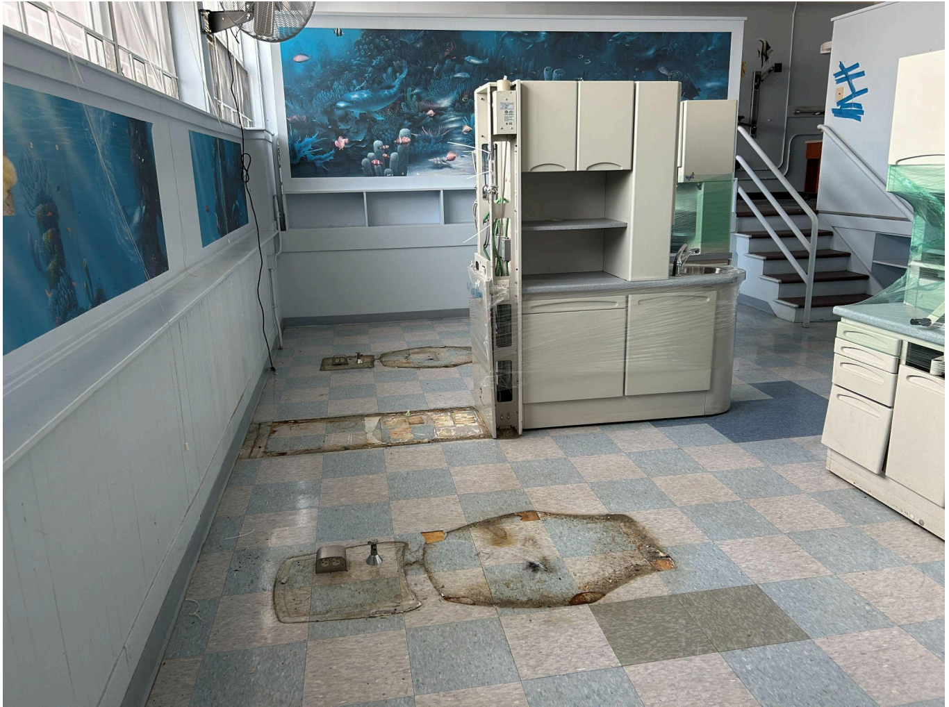
Picture of the Dental Suite showing the Dental Equipment that has been removed for access to the exterior wall. When the exterior wall work has been completed, the Dental equipment will be reinstalled to its original place.