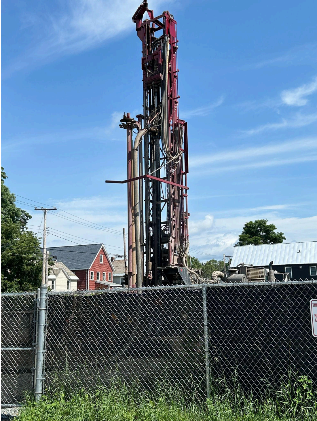
Picture of the last geothermal well being drilled in the playground yard.