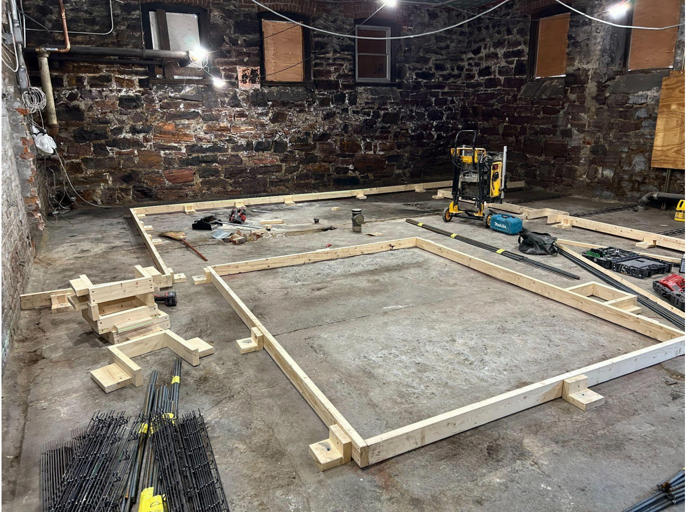
Picture of the concrete pads being formed so that concrete can be poured within these forms. These concrete pads are for the new mechanical equipment to sit on.