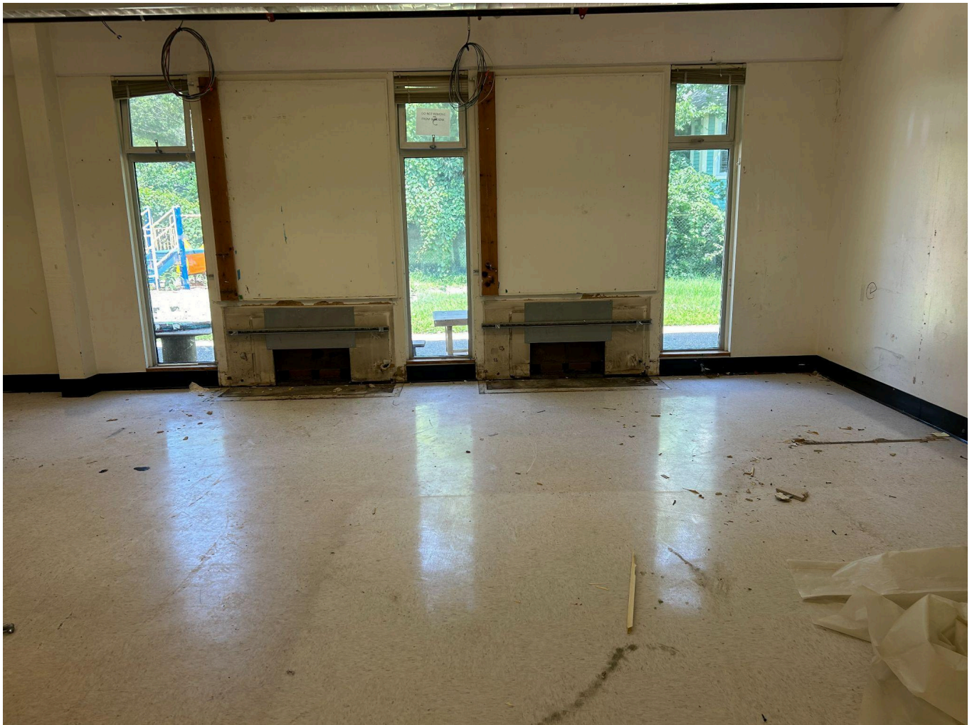
Demolition of mechanical equipment in the 1965 wing of the building. Room is now waiting for the removal of the exterior wall to be upgraded.