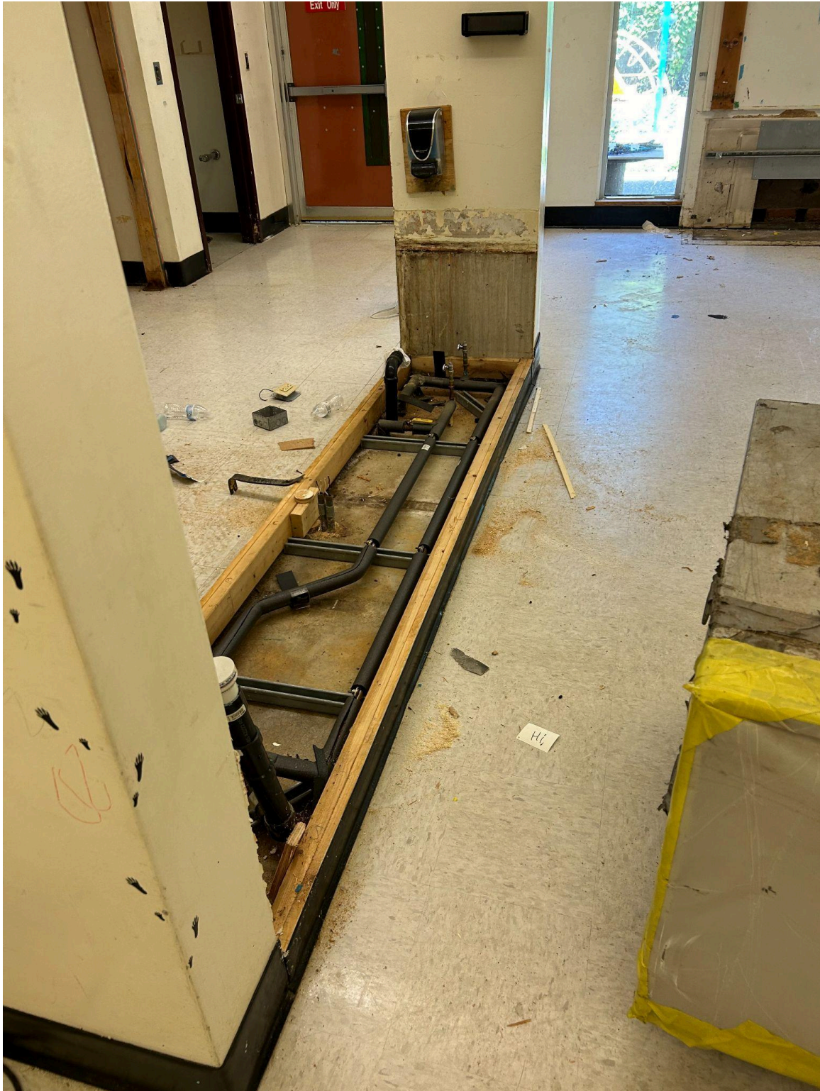
Cabinets within the 1965 classroom wing are removed for upgrades with the project.