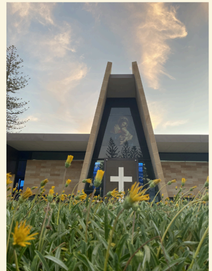
STELLA MARIS CHURCH