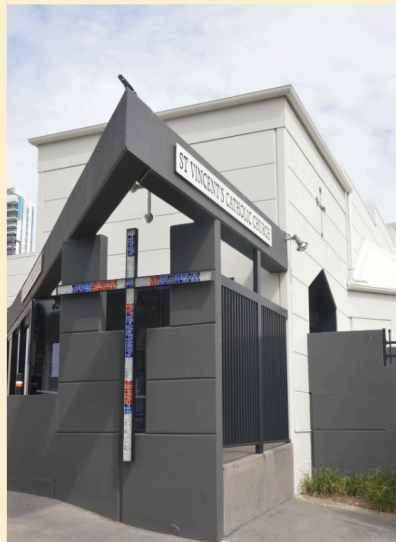
ST. VINCENT'S CHURCH

ITALIAN COMMUNITY 4.00 PM (25 December Only)