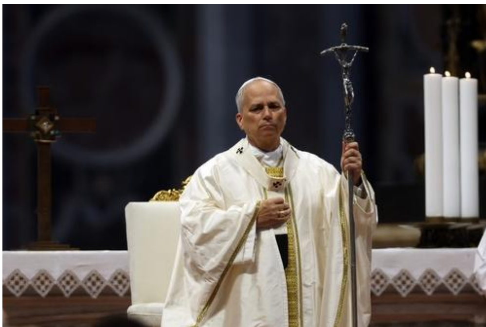
IMAGE: Vatican City, Italy June 15, 2025: Pope Leo XIV holds the crucifix in his hand. Pope Leo XIV presides over the Holy Mass of Sunday and the Jubilee of Sport on the central altar of St. Peter's Basilica.

Pope Leo XIV will celebrate a Mass for the Care of Creation on July 9