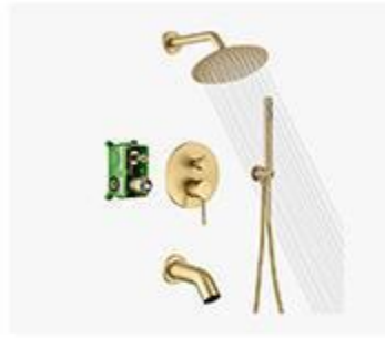
sumerain SUMERAIN Shower System with Tub Spout and... $212 00