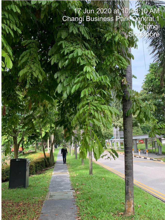
Opposite of lamp post 46

Solution : To fix a soil erosion barricade between the pathways and the soil.