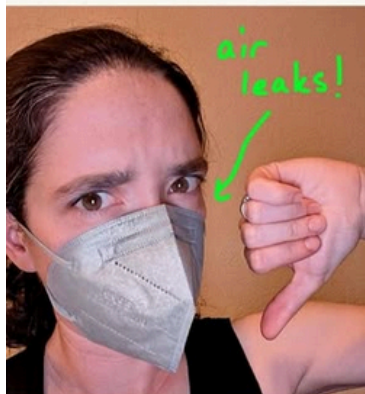
Pointy bifold nose wire

Fix your nose wire for a 5-10x safety boost!