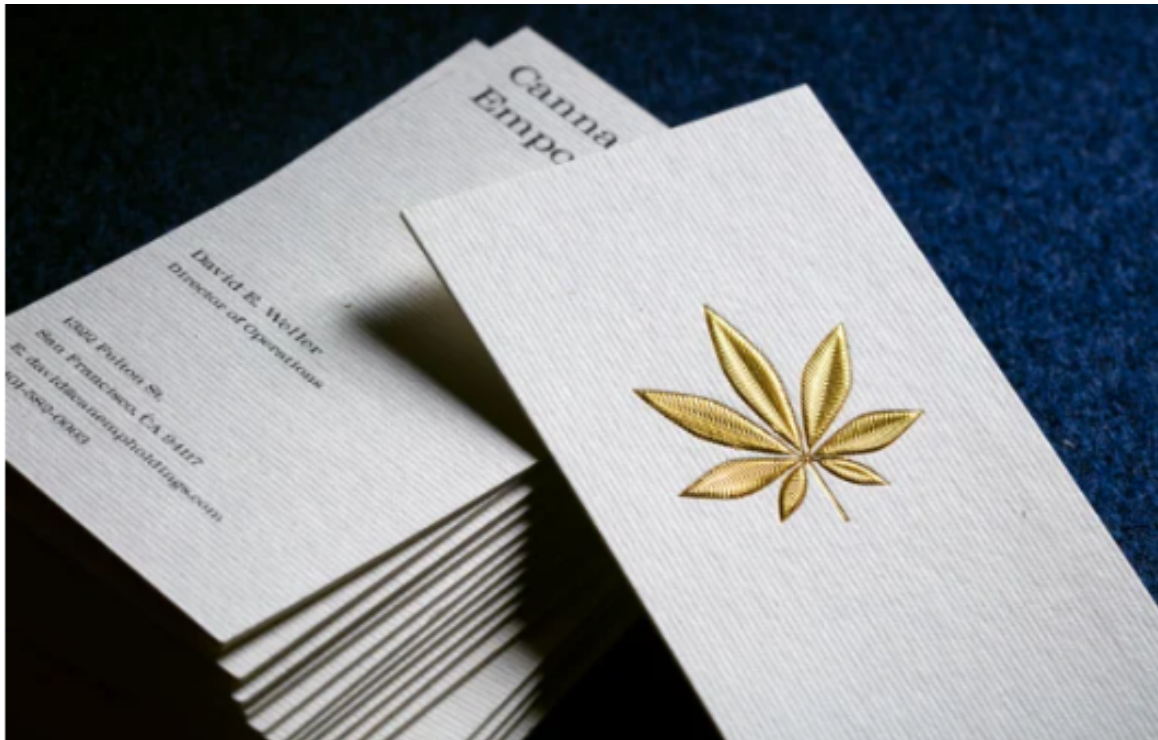
Cannabis Business Card Example | Jukebox Print