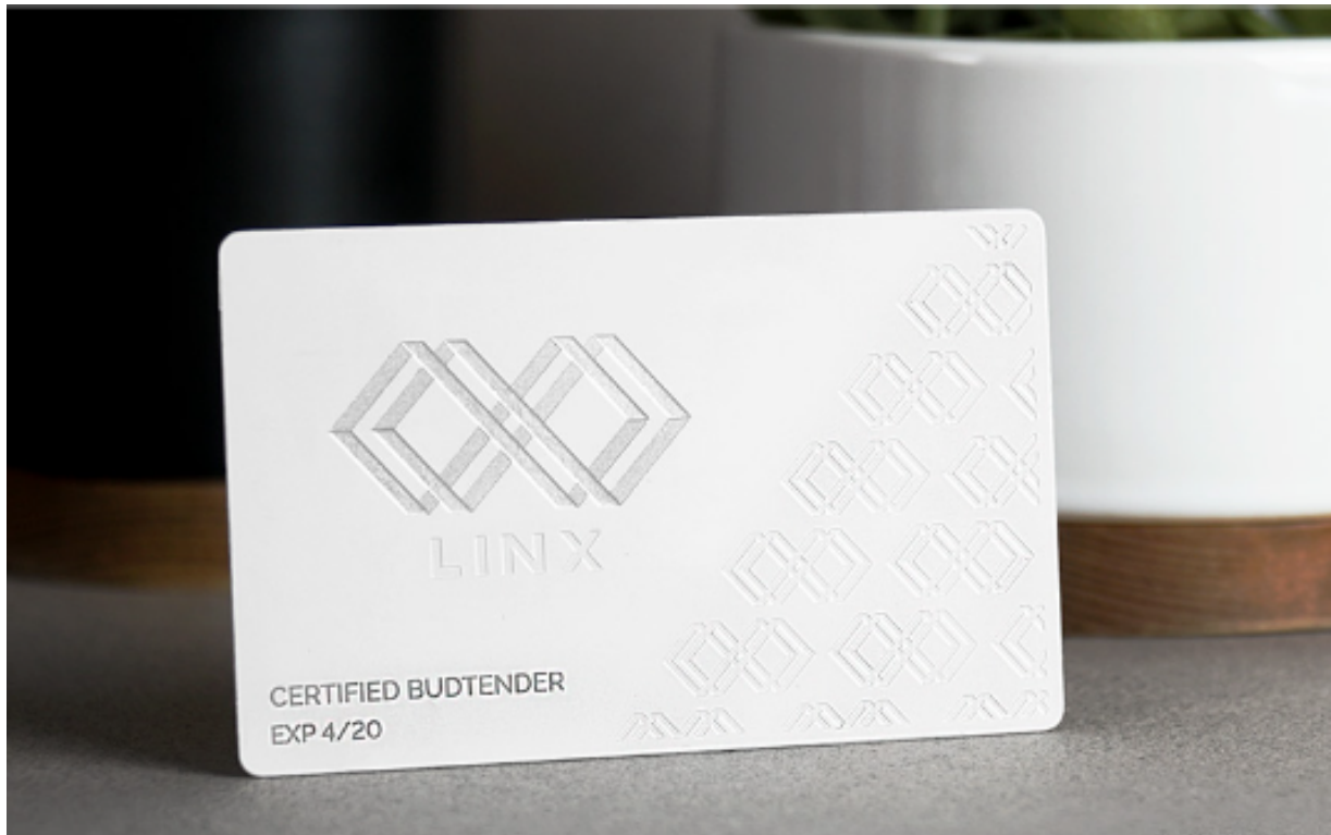
Creative Design Idea Cannabis Business Card | My Metal Business Card

However, there are more benefits to having a memorable business card, so let's take a deeper look at why having a killer business card is vital for your cannabis business and what this business card should contain.