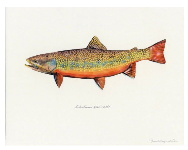
Yusei Nagashima title: unofo Watercolor