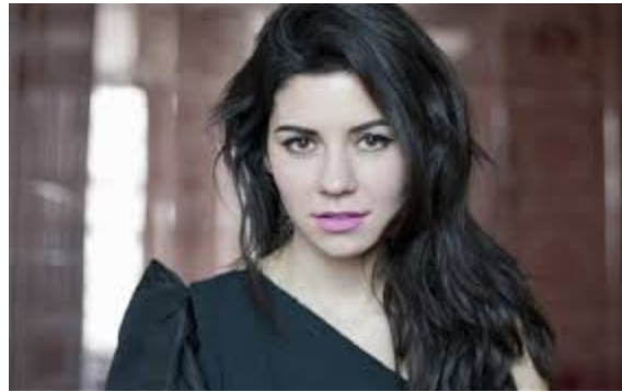
Marina and the Diamonds