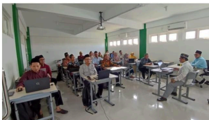
Figure 1. Learning Activities at Islamic University of Lamongan