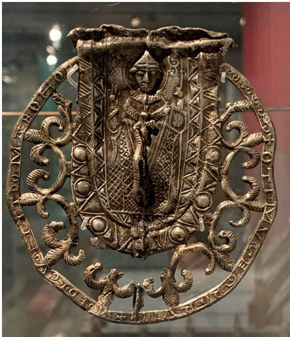
Canterbury pilgrim badge ca. 1200s-1300s. Taken by Mares at the Museum of London.