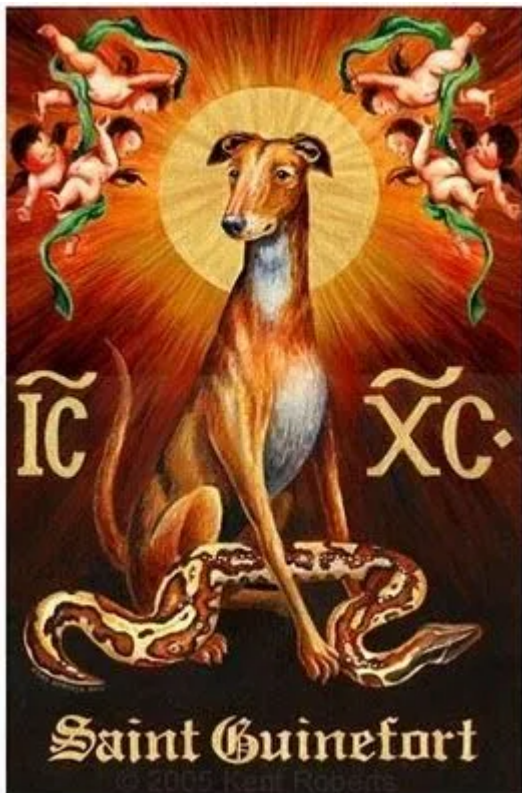
Good Saint Guinefort, faithful greyhound. Here's his story.