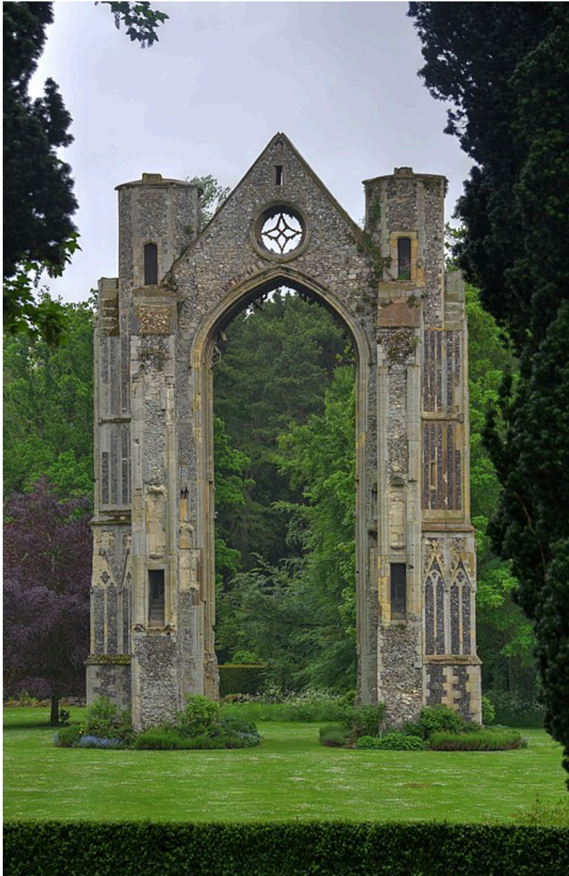
Walsingham priory ruins.