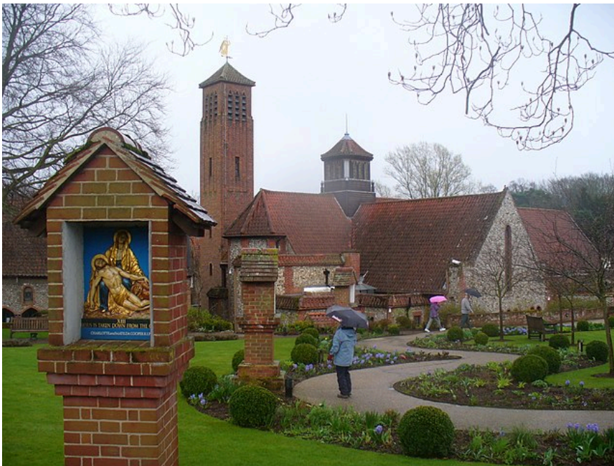
Contemporary Our Lady of Walsingham shrine garden.