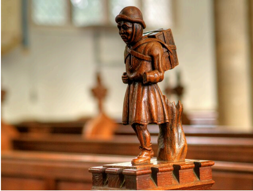
Here is Joseph Jacobs' brief version of The Pedlar of Swaffham from Project Gutenberg.