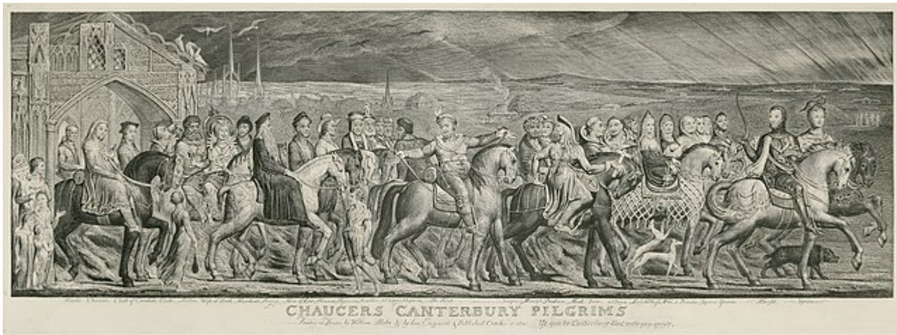
Chaucer's Canterbury Pilgrims by William Blake. Public domain.