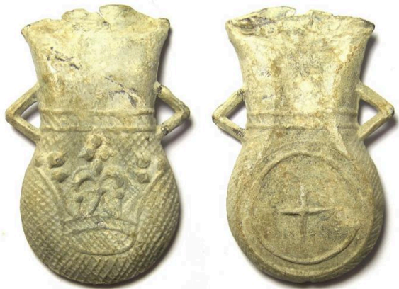
A 15th century Walsingham ampulla, used to hold holy water.