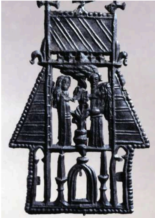
Pilgrim badge of the annunciation, from the Shrine at Walsingham. From the British Museum.