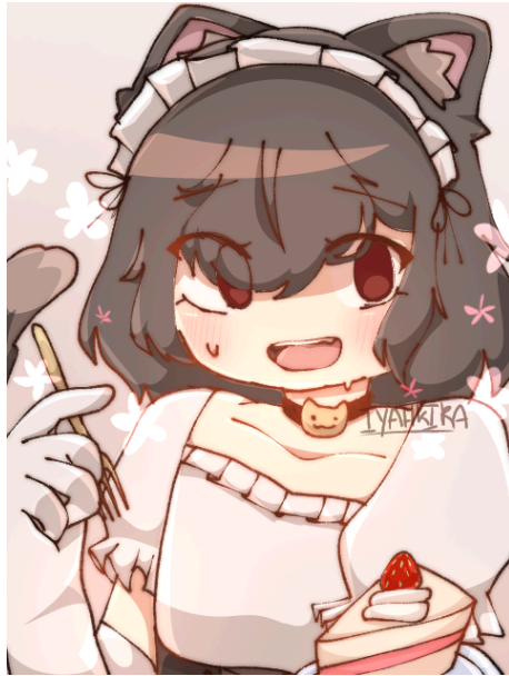
goro akechi

Teammates!? Friends!? To hell with that! Why am I inferior to you...!? I was extremely particular about my life, my grades, my public image, so someone would want me around! I am an ace detective... a celebrity! But you... You're just some criminal trash living in an attic! So how!? How does someone like you have things I don't!? How can such a worthless piece of trash be more special than me!?