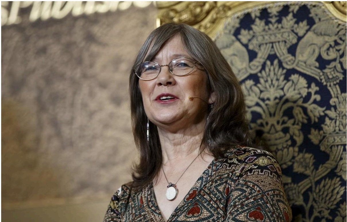
Alt: Robin Hobb