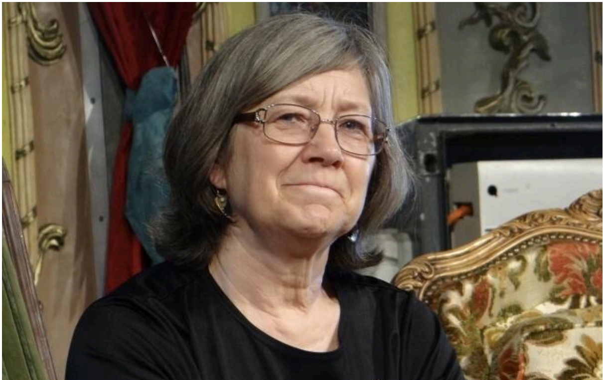
Alt: Robin Hobb

Robin Hobb, a pseudonym for Margaret Astrid Lindholm Ogden, is an icon in the world of fantasy literature. Her books, often set in the Realm of the Elderlings, have mesmerized readers worldwide with their intricate plots and deep character development. This article delves into some of her most acclaimed works, including the "Farseer," "Liveship Traders," and "Tawny Man" series.