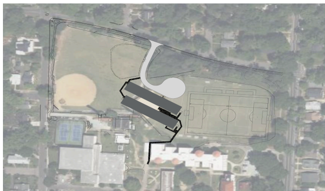
Modular site location

UniVille will be located where the softball field is now. It will be composed of two long student housing units connected to each other and to the rest of campus by new sidewalks. It will include lounge spaces, Community Coordinator apartments, and student rooms similar in size and furnishings to our typical student rooms. Students assigned to Hill for next academic year will move into UniVille in August on Move-in Day to begin the year, while students assigned to Reynolds will move into Reynolds.