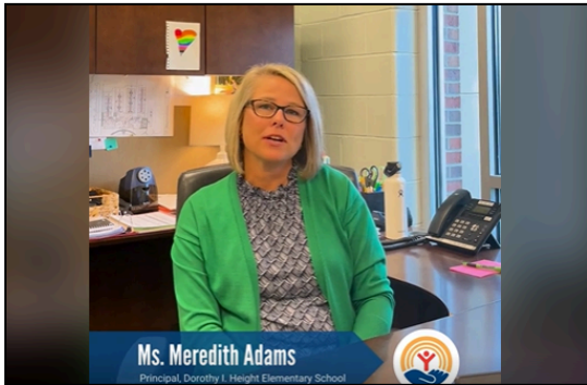
2024 Community School Coordinator Appreciation Week - United Way of Chattahoochee Valley

Need inspiration? Check out these videos from previous years.