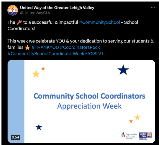
The Importance of the Community School Coordinator (CA Partnership for the Future of Learning)