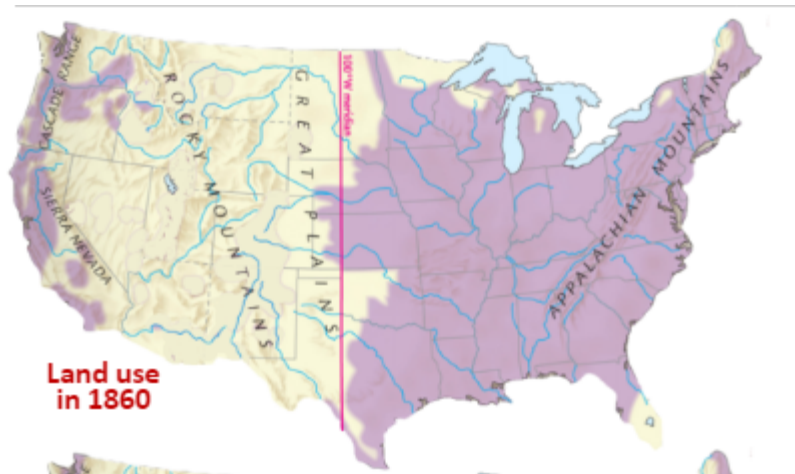
Below: Land Being used by Americans in 1860