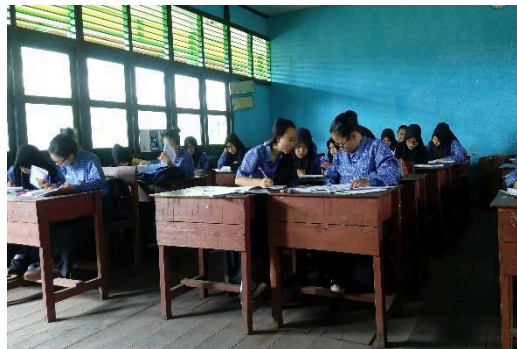
Fig 1. The Example of Figure 1

Wherever possible try to ensure that the size of the text in your figures (apart from superscripts/subscripts) is approximately the same size as the main text (11 points).