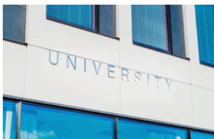
PATH TO COLLEGE