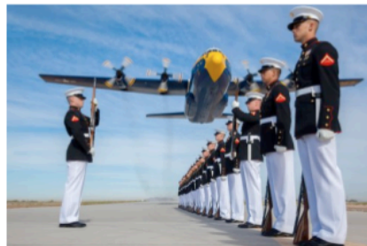
PATH TO MILITARY