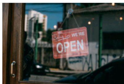
PATH TO BUSINESS OWNERSHIP