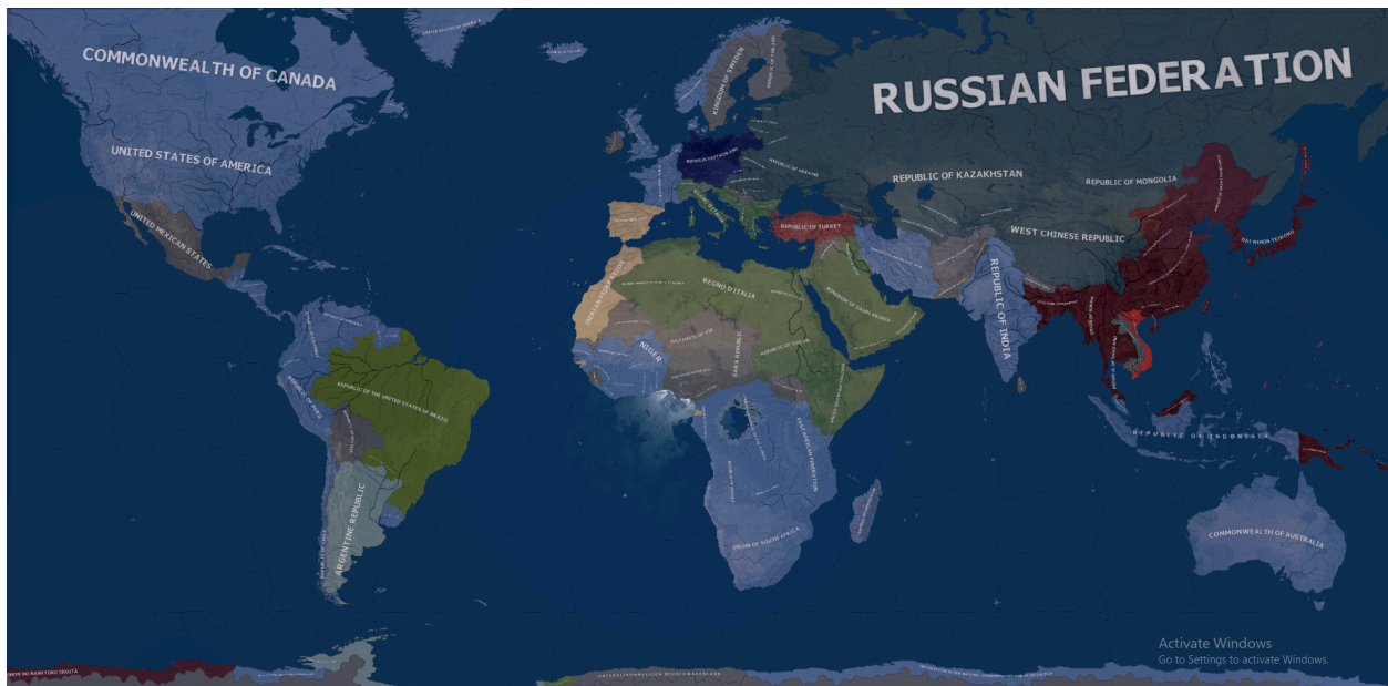
ECONOMIC SPHERE MAP (Pretend Serbia is part of Italy's Sphere)