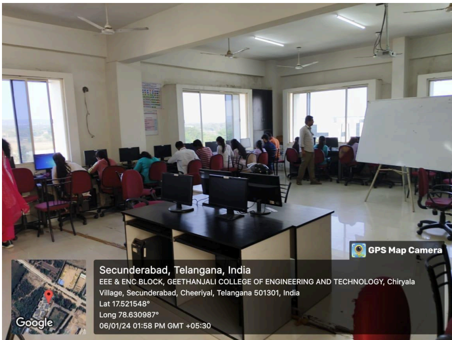
VAC exam conducted in SS Lab / ES IoT lab