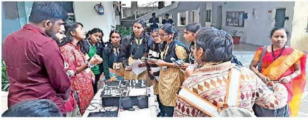
ప్రదర్శనను ఆసక్తిగా తిలకిస్తున్న విద్యార్థినులు