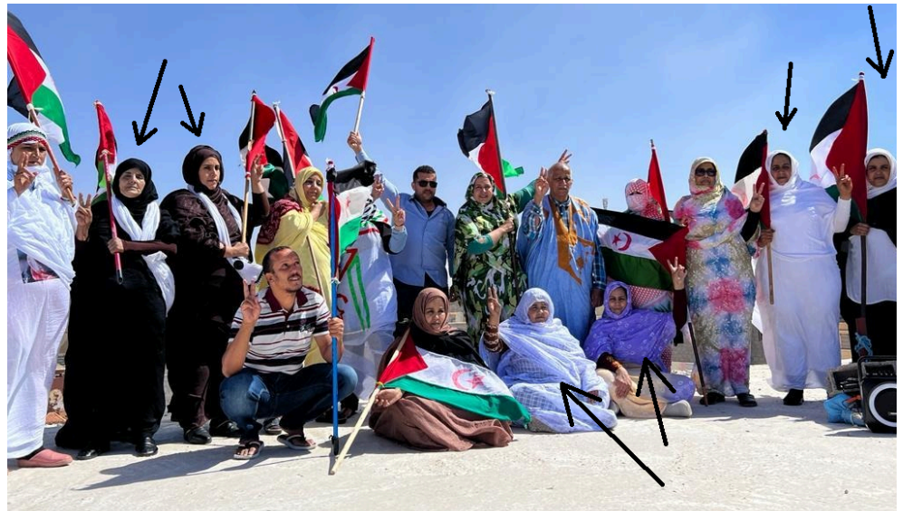
These women who participated in the nonviolent protest on the Khaya family rooftop on April 15, 2022 were tortured by Moroccan Occupations Forces on April 16, 2022.