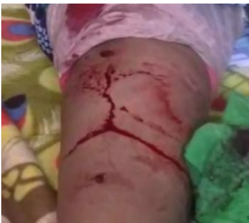
Injury to the leg of a woman victim of Moroccan Occupation Forces

Early reports from American guests in the Khaya family home suggest that the police are cracking down on community members who participated in a peaceful protest the night before. Other participants of the protest have had their homes surrounded by agents overnight.