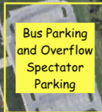
Bus Parking and Overflow Spectator Parking