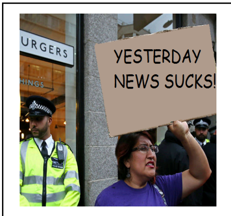
A totally legit image of the protest

The new radical anti Yesterday News group currently going by the name of "Exemplars", have attacked a restaurant named Yesterday's Burgers. They claim that they did it because it has the word "Yesterday" in it, which means it is allegedly a front for Yesterday News. The partial creator of Yesterday News was outraged because of the Exemplars' ignorance to the absence of the apostrophe in Yesterday News.