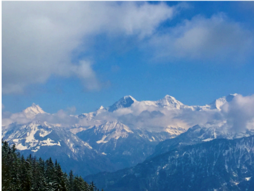
Figure 1. Mountains of Switzerland

I looked at the mountains and saw that each one was different, carved out over time by the snow, the wind, and avalanches. In spite of having experienced the same environment, they were all different. Each mountain has its own life story of when and how it was formed, a story that never ends. Underneath them all, though, lay their bedrock. I began to realize that whilst the six stories I had for my research were all very different, underneath them all lay the narrators’ experiences in their cultic groups. Taking the metaphor a little further, I wondered whether that bedrock went deeper for those with a long generational history, like mine. Along with my own experiences, I began to explore what the differences were between the stories of the two true SGAs and those of the other four storytellers.