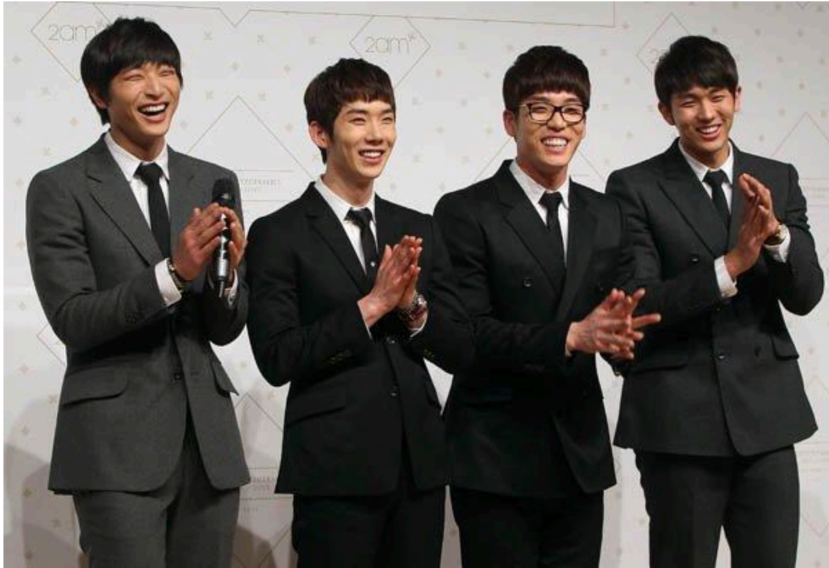
From left to right: Jinwoon, Jo Kwon, Changmin, and Seulong

So! Up first, an intro video to get y'all excited about this primer because they're amazing. The second intro, to try to get you to have feelings, is this one - their first music show win in February of 2010 ( here look at Jo Kwon being emotional because he'd been training since he was a kid and he never thought he'd be able to debut let alone win and he did!!!!).