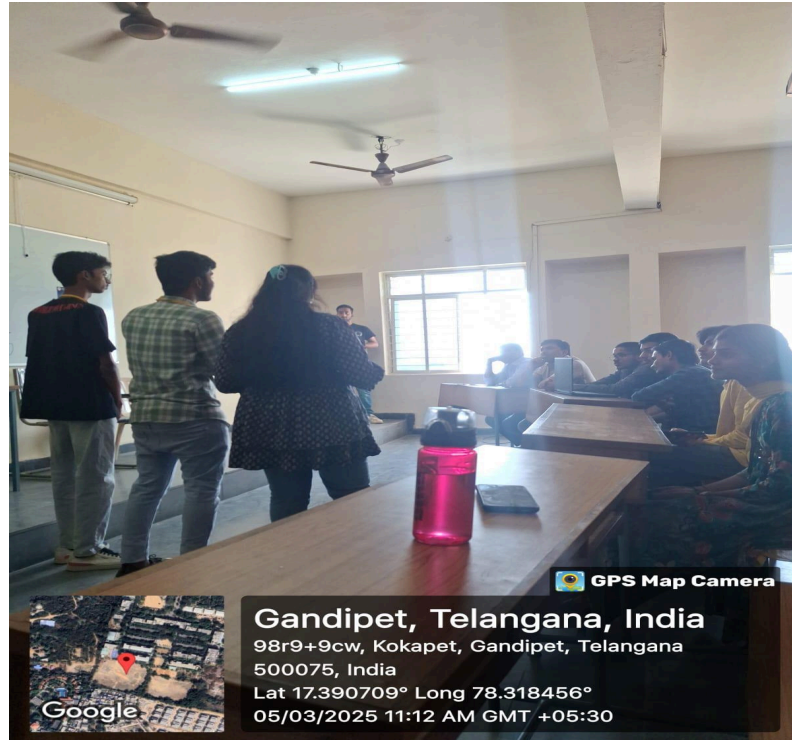
Fig. 6. Debate Round-3