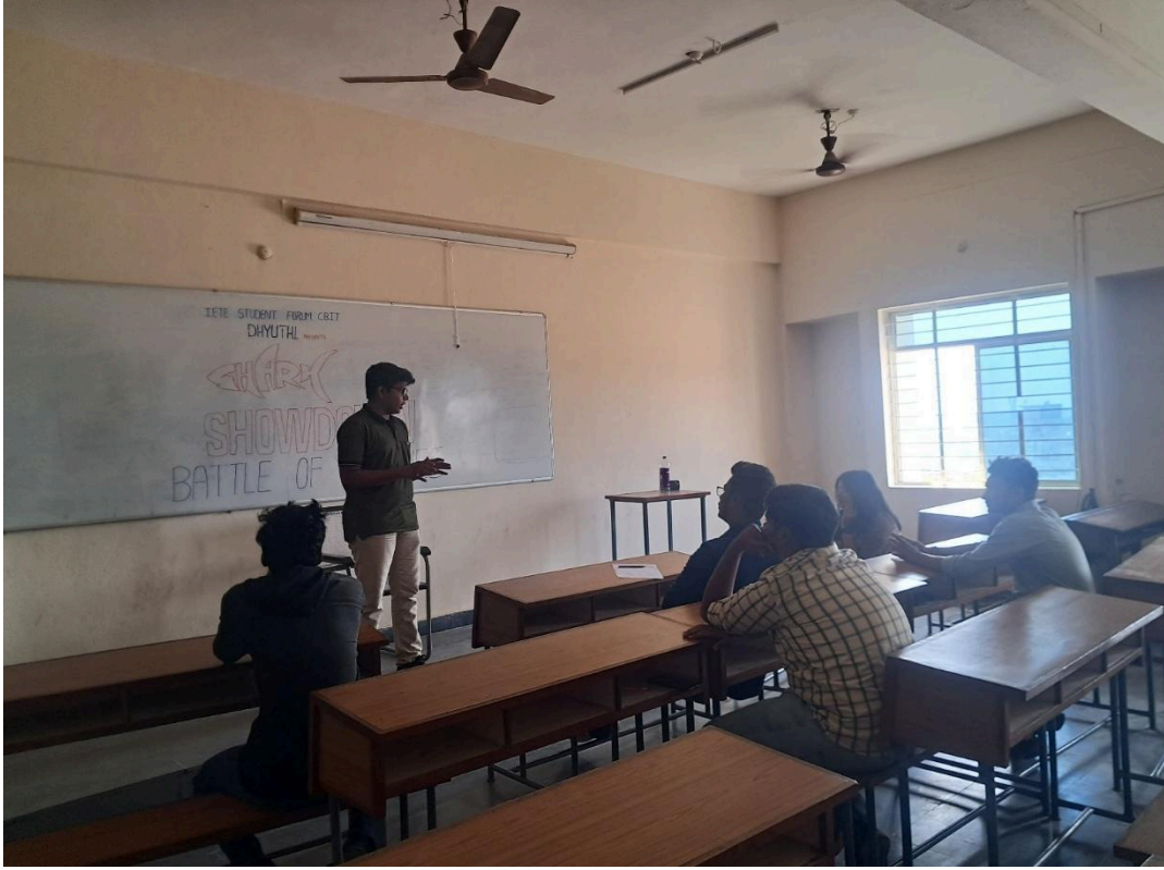
Fig.2 Debate Participants Round 1