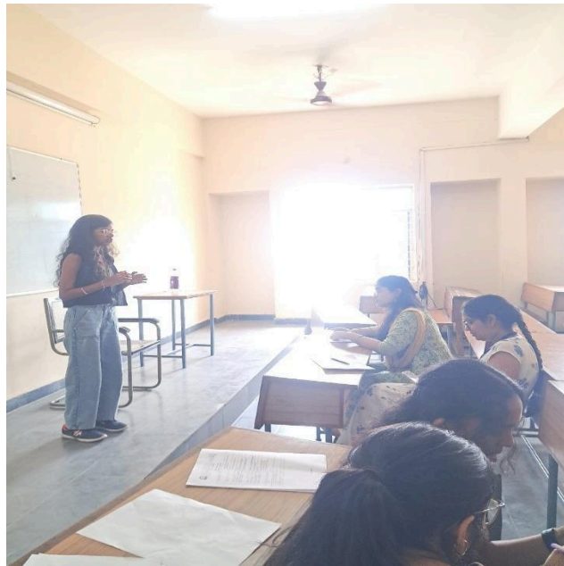
Fig.3 Debate Participants Round 1