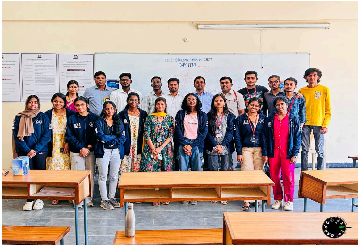
Fig.8 Group picture with the judge,faculty coordinators,student coordinators and with the participants.