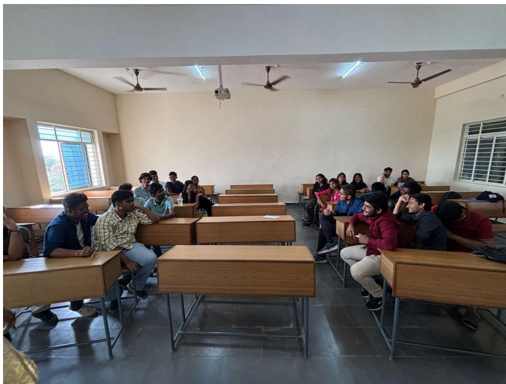
Fig. 4 Debate Round-2