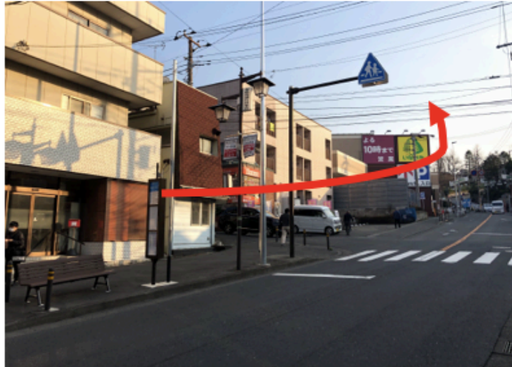
BST Nagasawa Sports Ground Entrance

Get off at the bus stop of "Shunjuen entrance 春秋苑入口" and go to the direction of the supermarket "Inageya いなげや" 春秋苑入口バス停降車。スーパーいなげや方面に進む