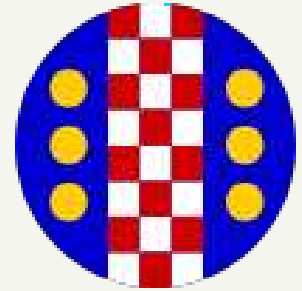
Exchequer Lady Astrid Folkadottir