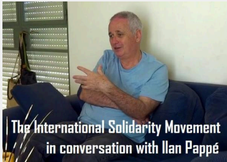
The International Solidarity Movement in conversation with Ilan Pappé