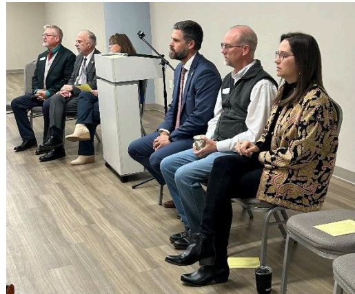
Elected officials take questions from the audience.