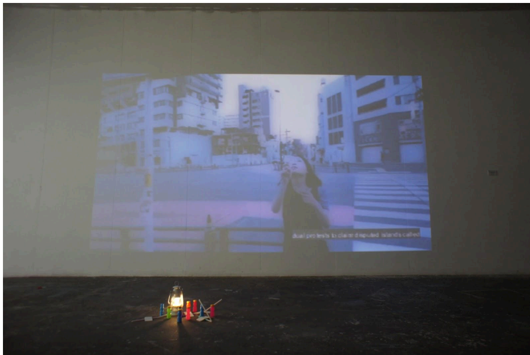
《exhibition title》Shin-Okubo Boomerang 《year》2013 《place》Tama art Univ.