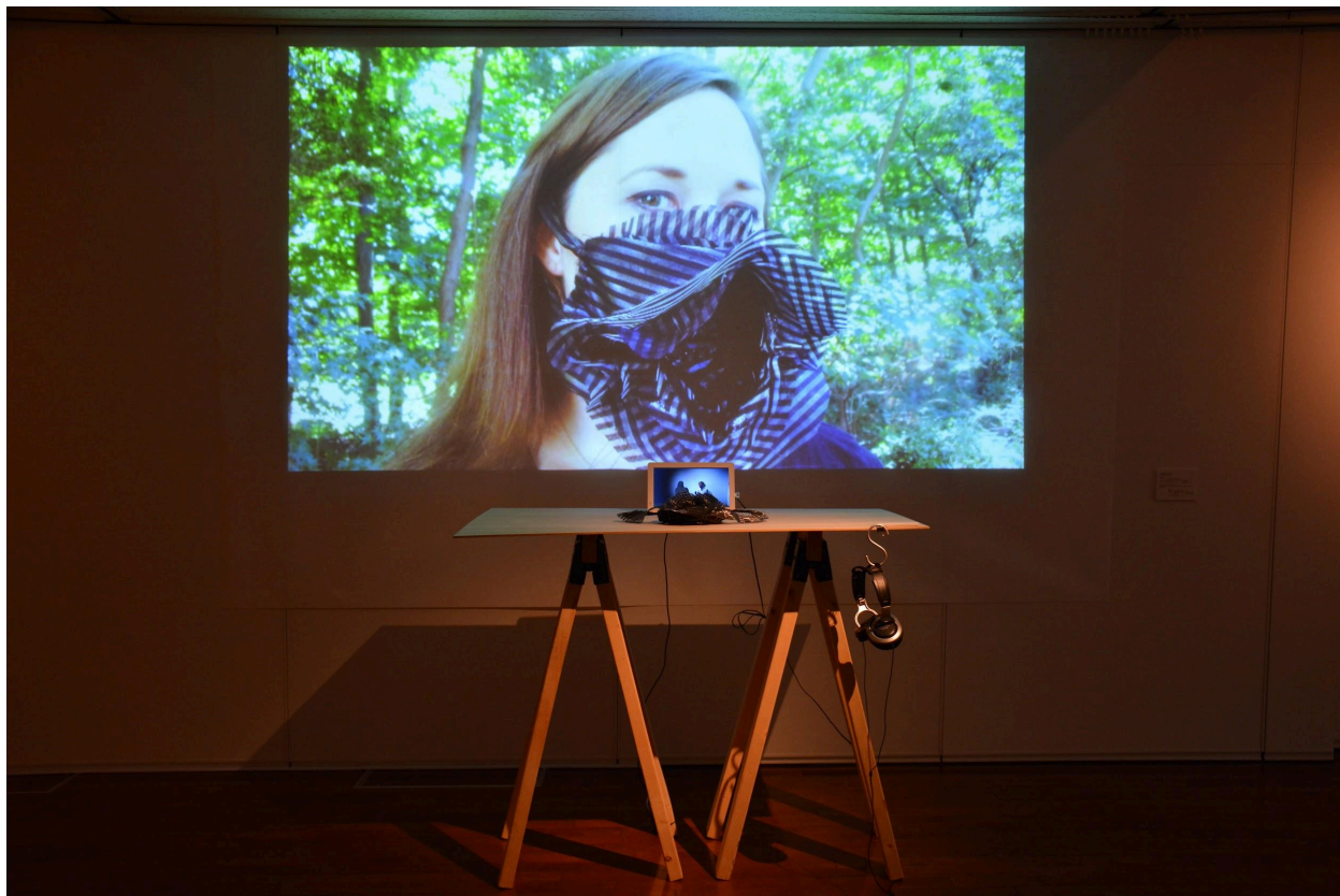
《exhibition title》Nike Curator's selection#01 Art complex 《year》2016 《place》Joshi gallery nike