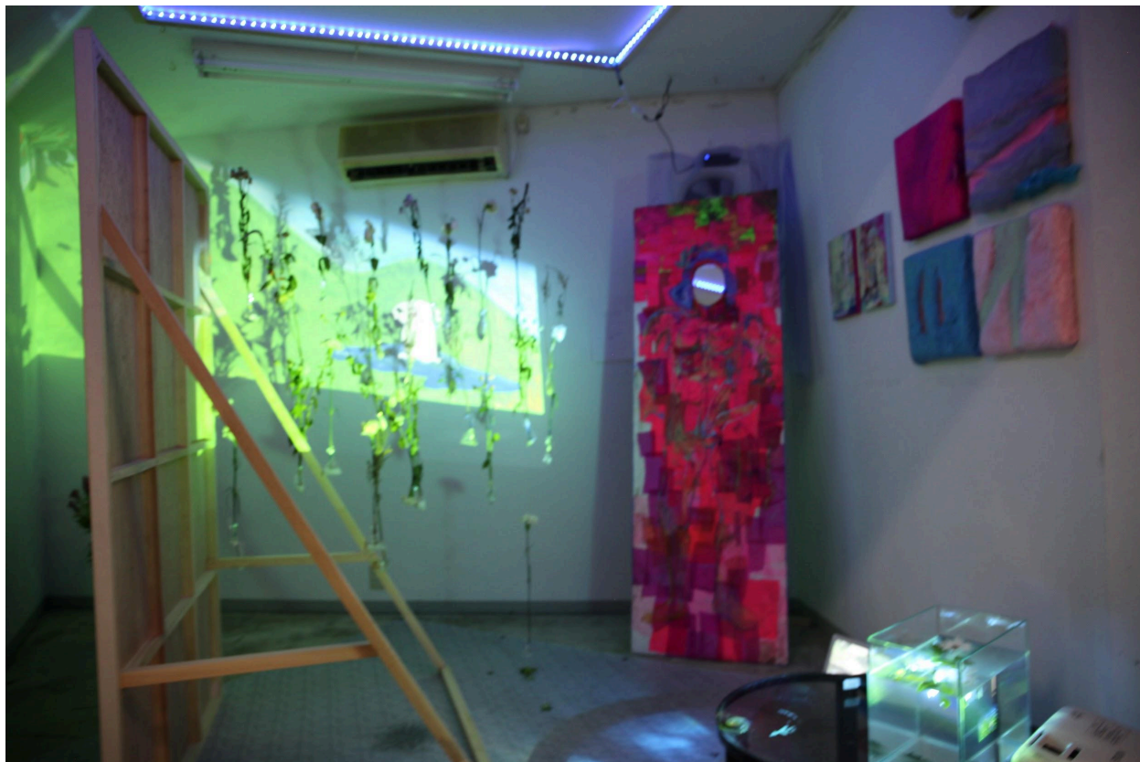
《exhibition title》BOYS LOVE -flower- 《year》2017 《place》Nogata no kuhaku