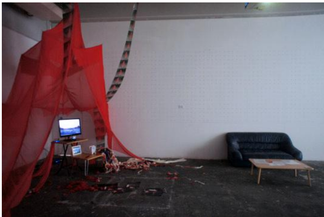
《exhibition title》Achela 《year》2013 《place》Tama art Univ.