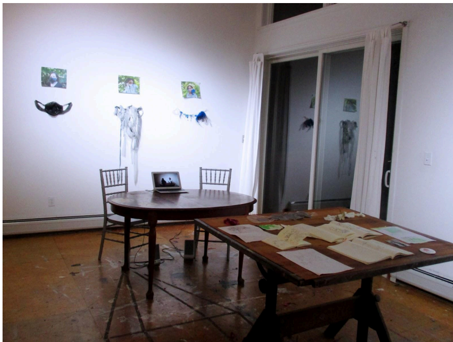
《exhibition title》Mask 《year》2015 《place》Residency at Vyt - The Art Students League of New York