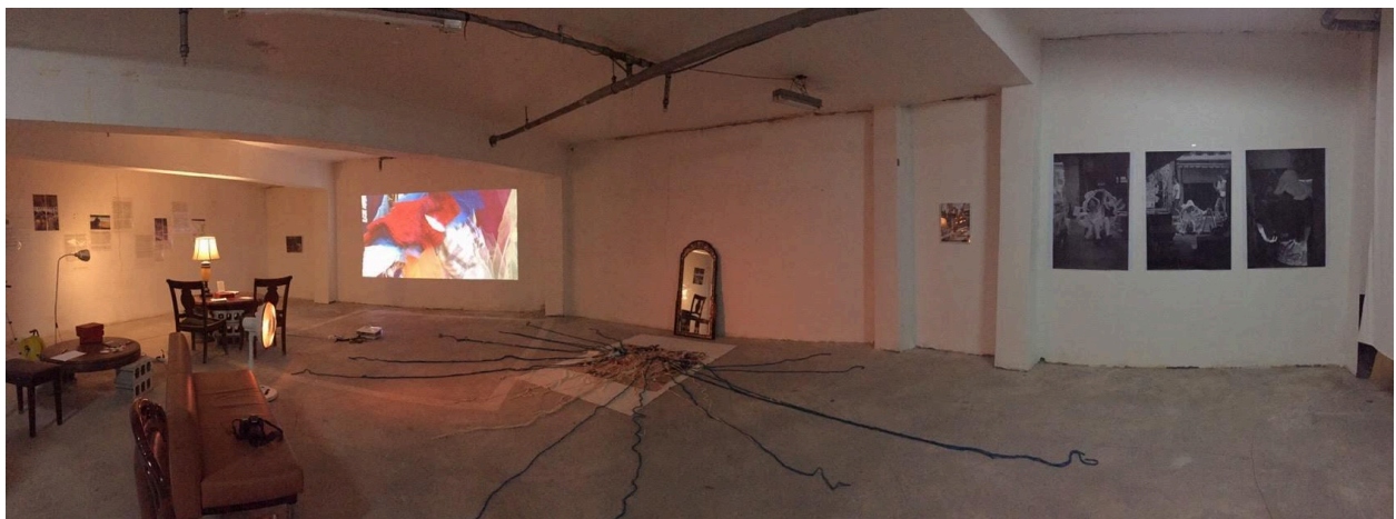
《exhibition title》KINTO Minami solo exhibition 《year》2018 《place》 dongsomun, Seoul, Korea《material》Performance, video installation, photos