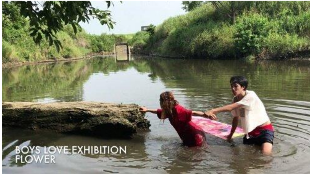
《exhibition title》BOYS LOVE -flower- 《year》2017 《place》Nogata no kuhaku