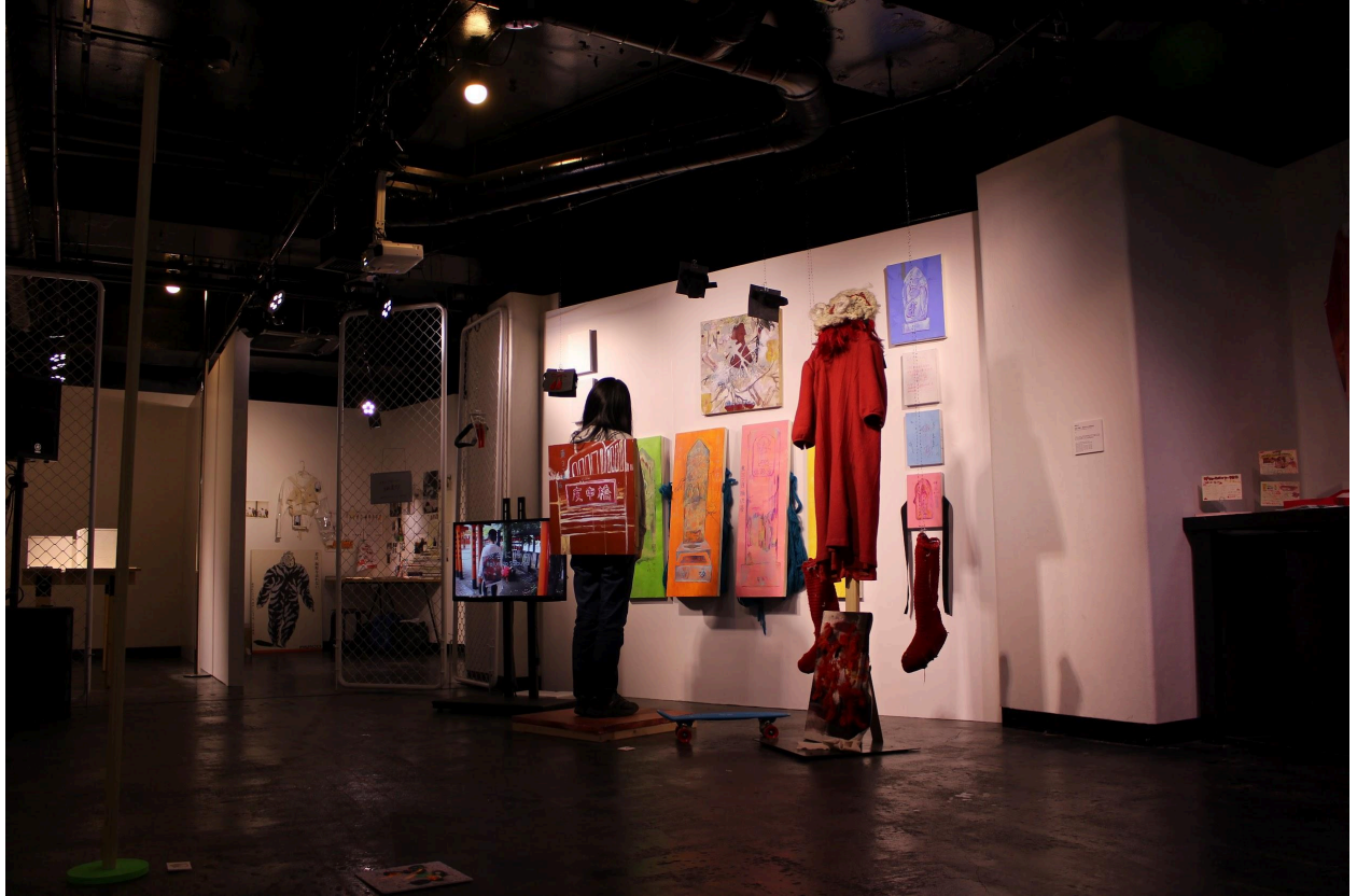
《exhibition title》Return to Shibuya 《year》2017 《place》 GALLERY X BY PARCO, Shibukaru Matsuri 。《material》text, video installation, paint on the paper, people with paintings 《size》This time, 400×300×250 cm