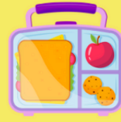
Lunchbox & Snack