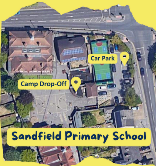
Sandfield Primary School