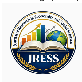
Figure 1. JRES logo (Calibri, 11 pt.)