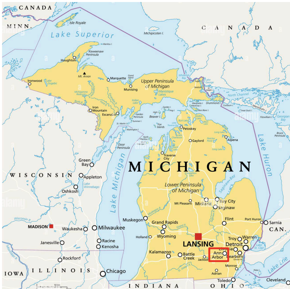
Figure 1. Ann Arbor location in Great Lake Area

Ann Arbor belongs to the state of Michigan, MI and people usually use a right-hand glove facing themselves indicating the location of Michigan and Ann Arbor.