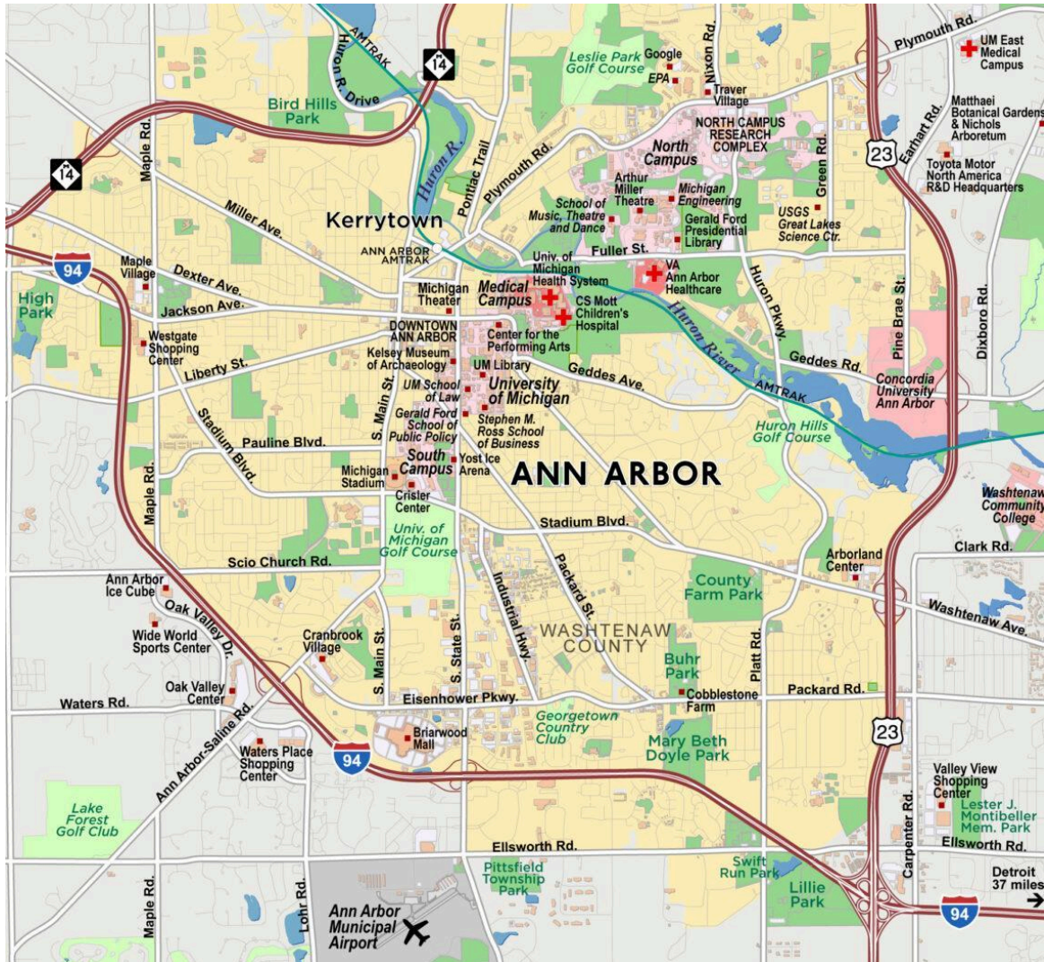
Figure 2. Ann Arbor Map (ANN ARBOR, MICHIGAN)

The University of Michigan is situated at the center of Ann Arbor. It comprises North Campus (engineering school), Central Campus (primary campus), and South Campus.