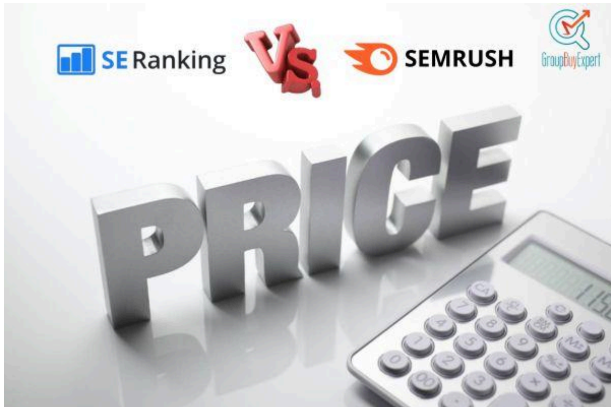
Comparing the costs of SE Ranking and Semrush

Alt: Detailed analysis of SE Ranking vs Semrush