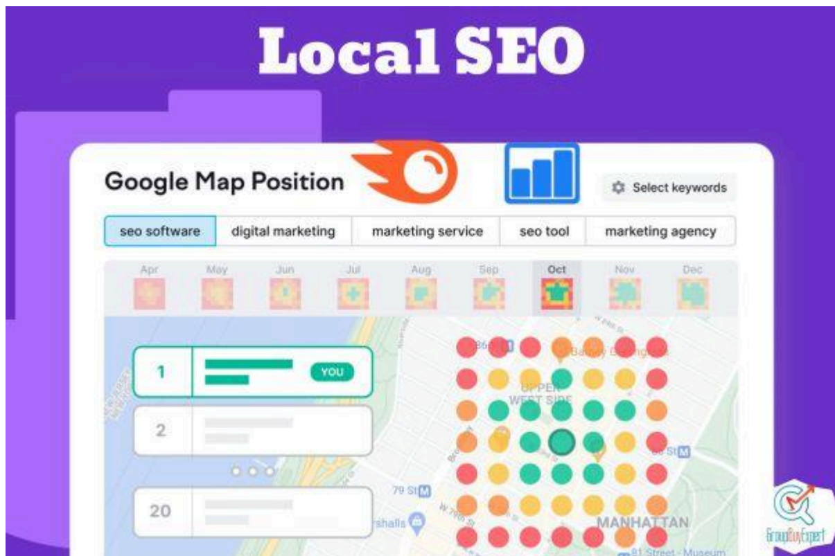
Comparing the local SEO features of SE Ranking and Semrush

Alt: Assessment of SE Ranking vs Semrush benefits