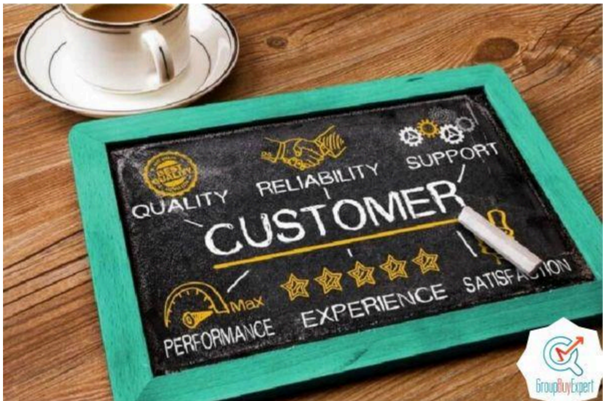
Evaluate customer support services offered by SE Ranking and Semrush Alt: Breakdown of SE Ranking and Semrush