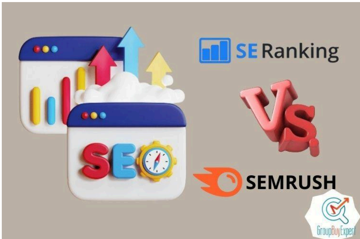
A comparison between SE Ranking and Semrush's features

Alt: Thoroughly compare SE Ranking vs Semrush features