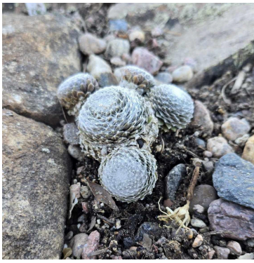
Sempervivum Gold Nugget - Photo March 2025