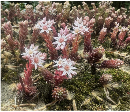
Dream Dazzler - Will die back in Winter but will grow back.