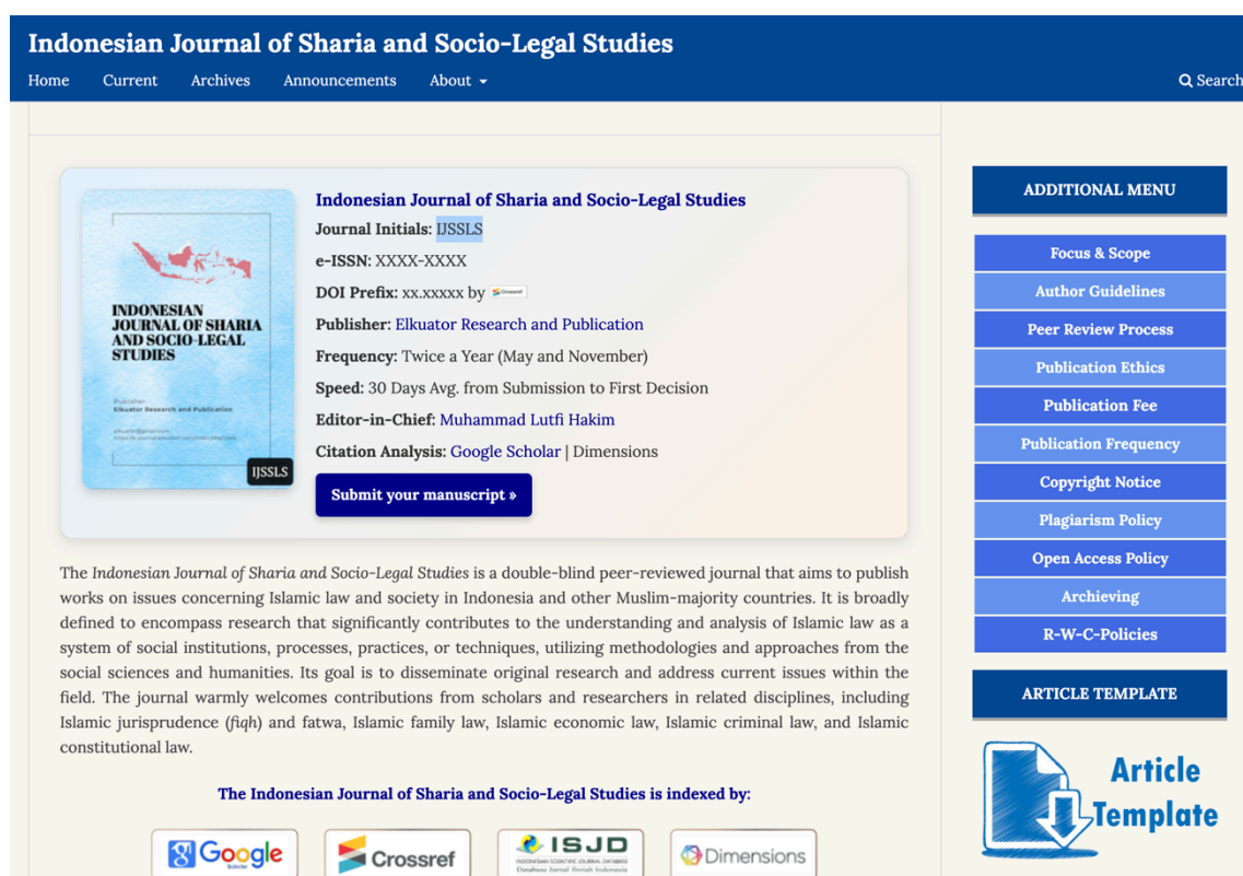
Figure 1 Information of the Figure