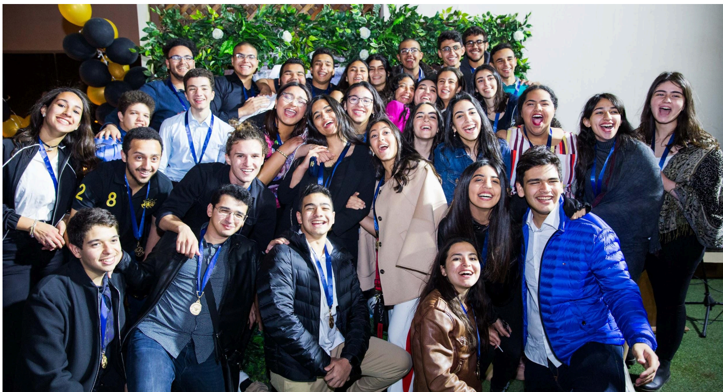
IB Awards Night - Class of 2019

We look forward to watching you grow through that challenging and enriching experience. We are confident that you will find it engaging and rewarding.