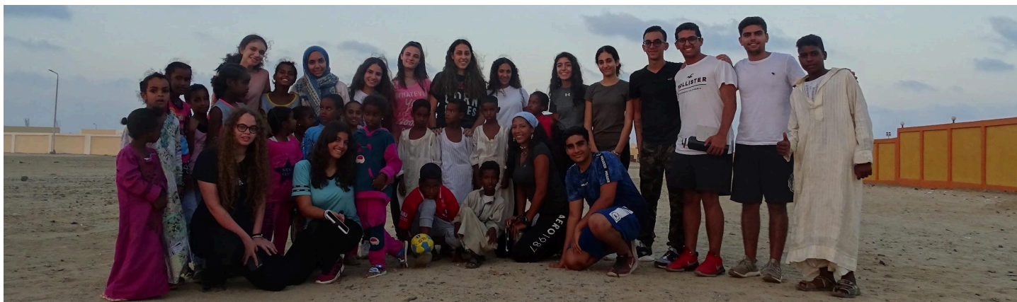
Junior CAS Retreat - Marsa Alam 2018

These programs encourage students across the world to become active, compassionate and lifelong learners who understand that other people, with their differences, can also be right.