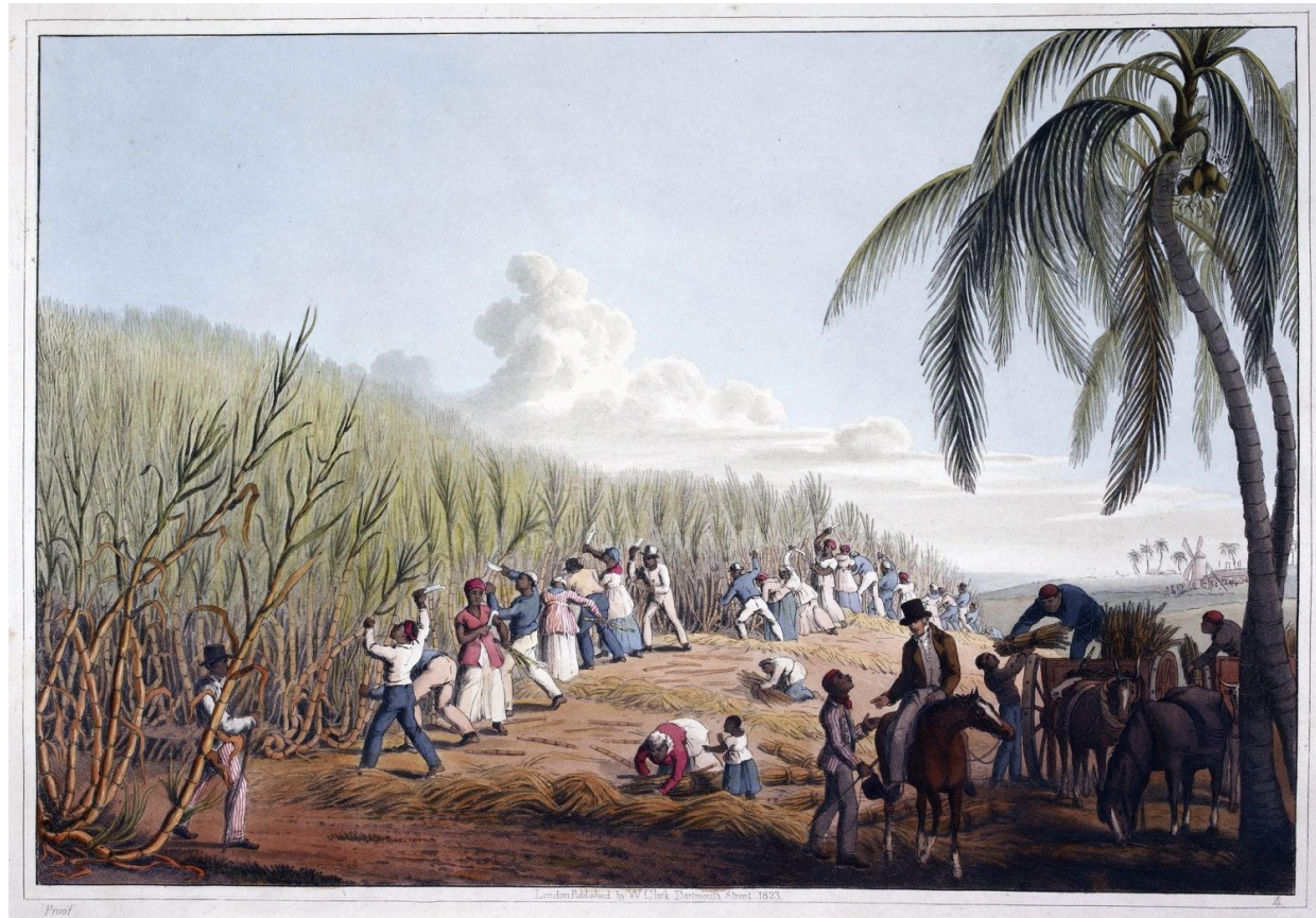
Slaves Cutting the Sugar Cane, public domain.