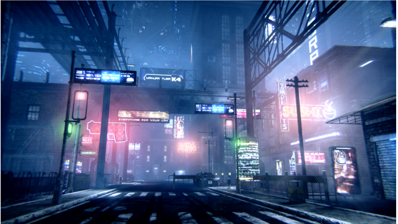
Foggy Lights used to enhance neon tubes. Dark City environment by Manufactura K4