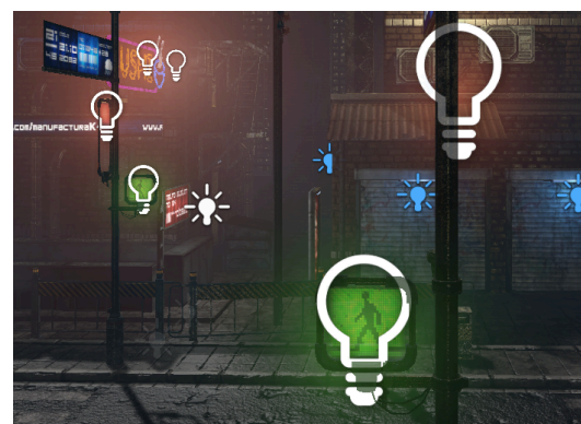
Foggy Lights Editor Icons & key positions

"Foggy Lights" is a visual effect that creates a light halo. It provides you with the option to add a light that matches the glow color and intensity in real time. It takes into account scene depth in order to avoid hard intersections with the environment. You can also offset the effect to make it appear closer or further. Foggy Lights will enhance light sources in your scene as you can see in the image above.